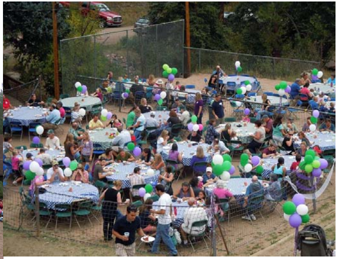
The Big Setup!

This is what 550 people look like at one place at camp!