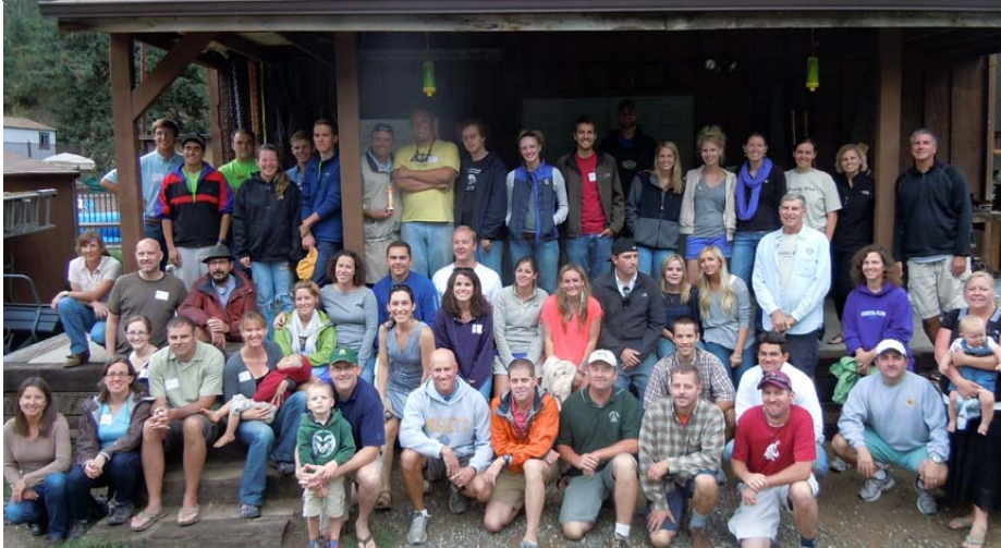
"If you were ever on Work Crew, meet at the Shop!"

This is what 550 people look like at one place at camp!