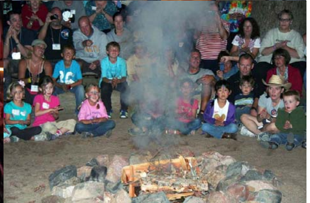
Ceremonial Magic Fire Lighting—"Do you believe in Elves and Fairies? Good. The Fairies want the children to move back from the fire!"