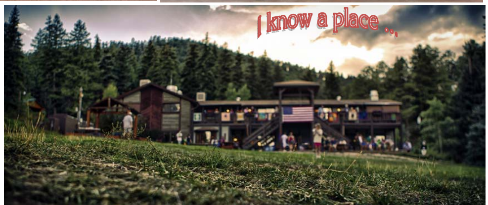
I know a place...