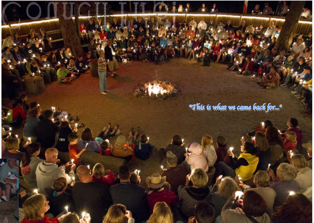
"This is what we came back for..."