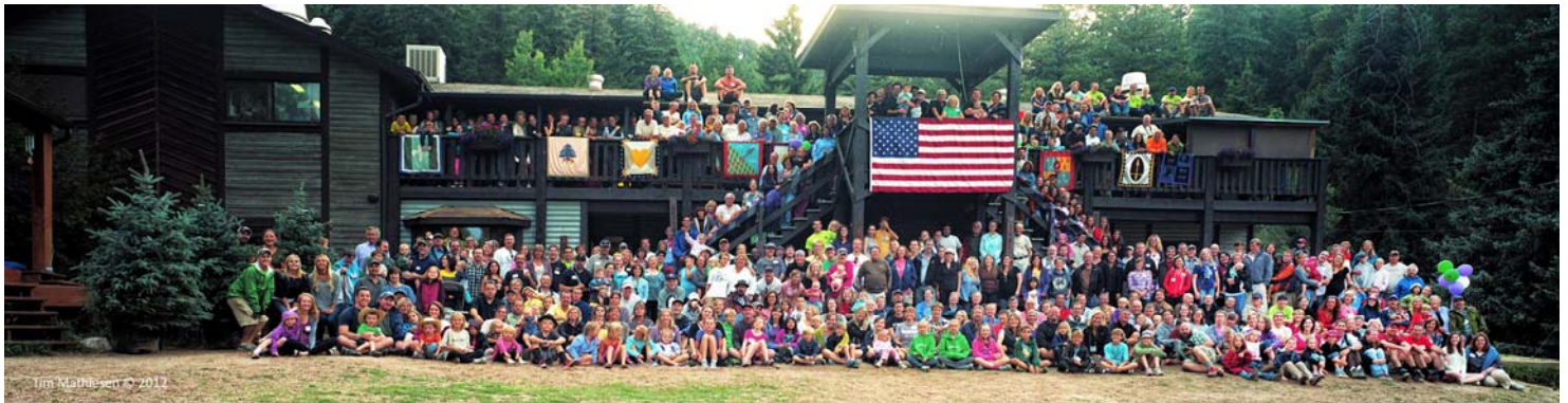
Tim Mathiesen © 2012