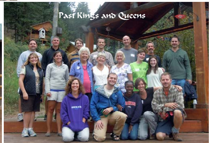
Past Kings and Queens