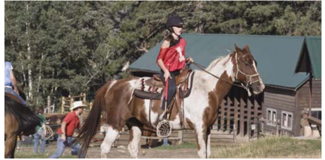
New, fabulously popular horse activity: Polo-crosse!

the camp newspaper, and take photographs to my hearts content. I enjoyed training the next group of upcoming counselors, what I felt to be an important "investment" in staff." Well Trix, it was, and the harvest is still being reaped, thanks to leaders like you who