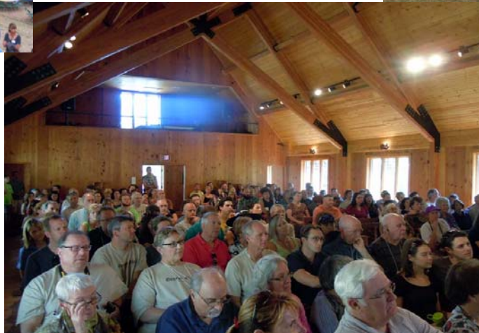
Unforgettable Chapel Service to start the day